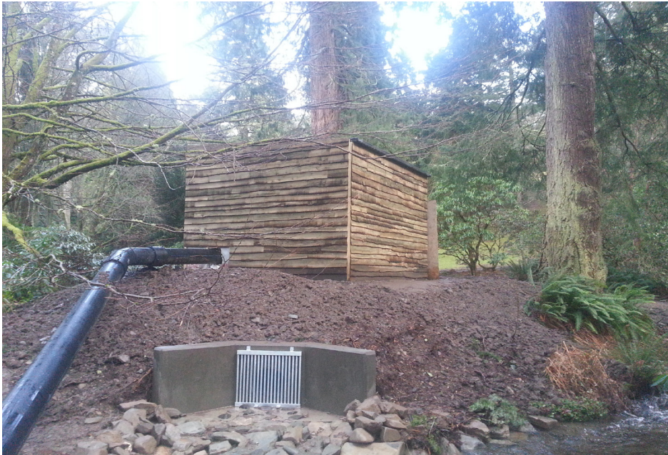
Above and below: Turbine house at Dawyck Garden