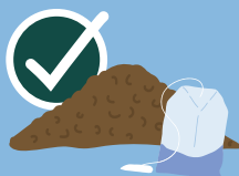
COFFEE GROUNDS & 100% PAPER TEA BAGS