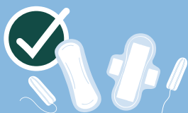
ONLY NATRACARE PRODUCTS