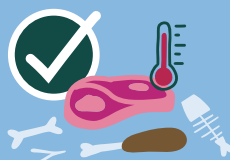
MEAT, BONES & FISH